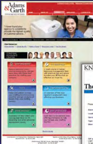
Staffing Resource Center