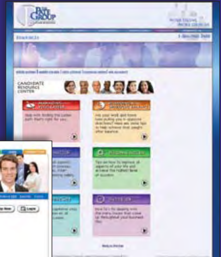
Candidate Resource Center

Our tools keep clients and candidates coming back, again and again.